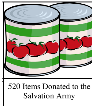
520 Items Donated to the Salvation Army

Thank you again to all who participated!