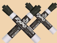
Black Expo Markers (2-4 thick ones)