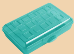
Plastic Supply Case