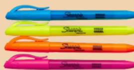
Highlighters any color (1-2)