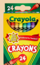
24 pack crayons