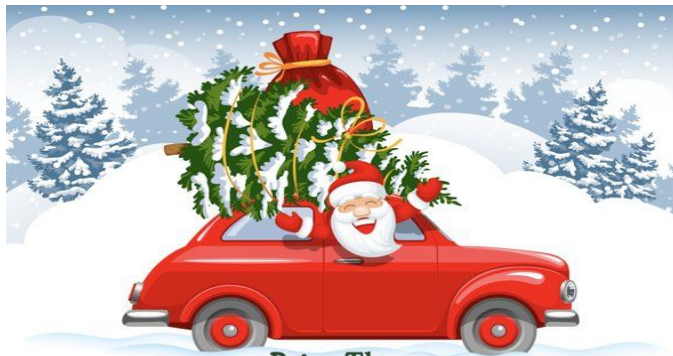
Drive-Thru Santa Car Parade

The weather may not always feel like winter is coming but it is almost here. That means Santa is coming!!! He will be at Ansonia High School December 11th from 5 pm until 7 pm. Stop by and wave Season’s Greetings or drop off your letter to Santa. Please stay in your car, wear a mask, and wave a safe 6 feet Season’s Greeting to him so he can continue to travel the globe for Christmas. He is bringing a special raffle prize for those who attend this event!