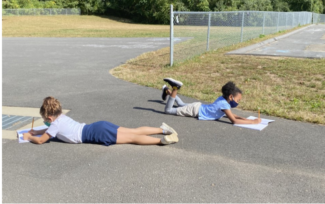
2nd Grade making hard work look easy!